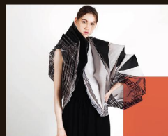
HKDI Young Design Talent Award 香港知專設計學院青年設計才俊獎