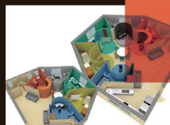
CreateSmart Young Design Talent Special Award 創意智優青年設計才俊特別獎