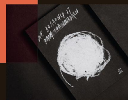
PolyU School of Design Young Design Talent Award 香港理工大學設計學院青年設計才俊獎